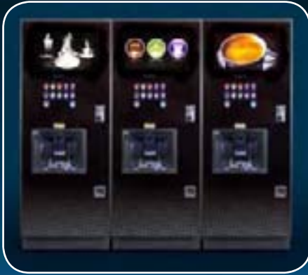
Cool Mono Iconic Warm Espresso

Neo from Coffetek brings the coffee shop directly to you, serving a delicious range of high quality hot & cold* beverages. Finished in ebony gloss the angular design provides a stunning look which will compliment any environment.