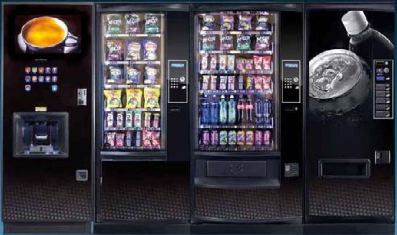
Shown in Neo ebony gloss finish